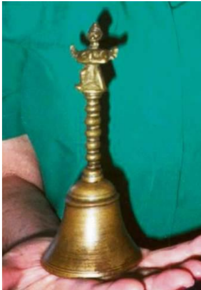
A hand crafted bell found in a 300 million year old lump of coal!

The seam from whence this lump of coal was mined is estimated to be 300,000,000 years old!