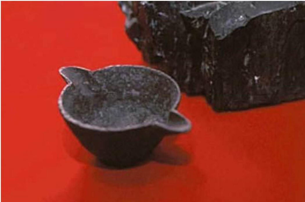
A cast iron pot found in a lump of coal.

Yet another report found in the Epoch Times told of a Colorado rancher who in the 1800’s broke open a lump of coal, dug from a vein some 300 feet below the surface, and discovered a “strange-looking iron thimble.”