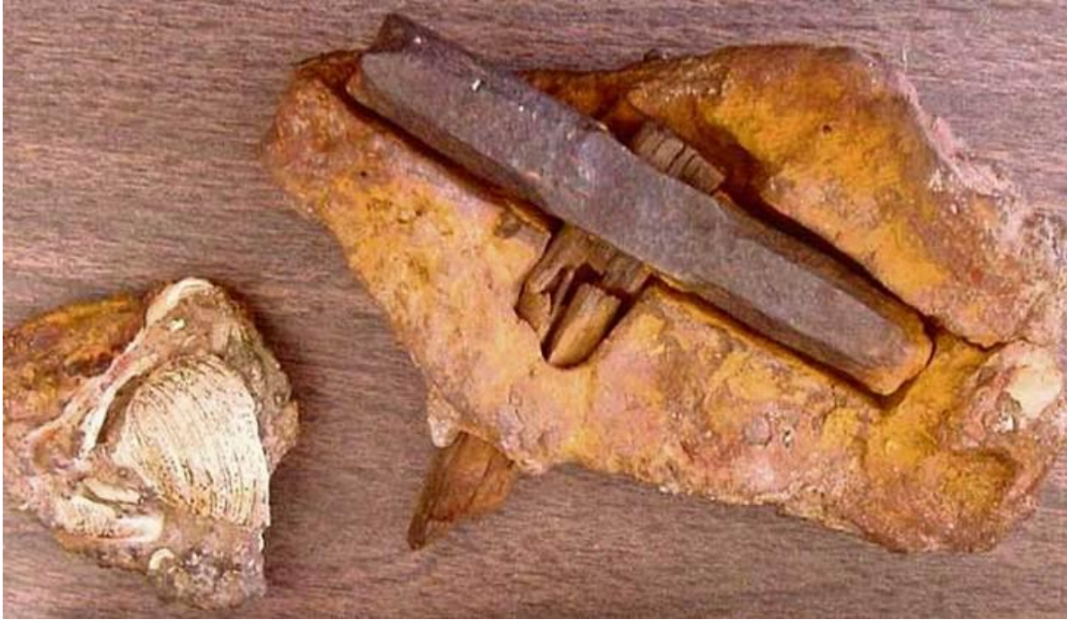
A half billion year old hammer embedded in rock that formed 400 million years ago.