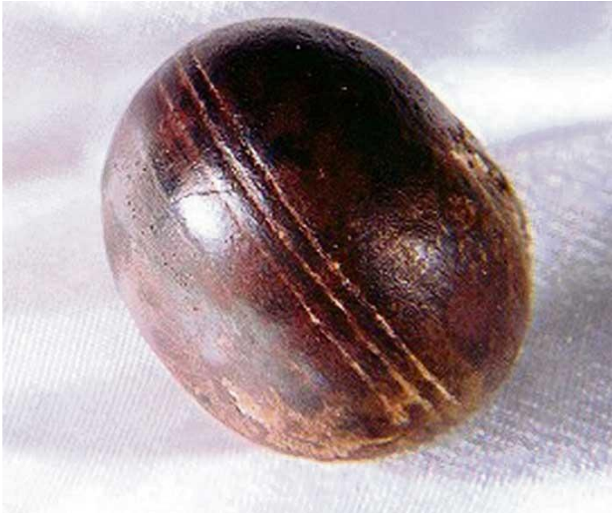
A Klerksdorp sphere

Geologists have attempted to debunk these artefacts as natural formations or “limonite concretions”. They fail to explain sufficiently how these formations occurred naturally with perfectly straight and perfectly spaced grooves around the centres.